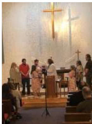
Baptism April 23