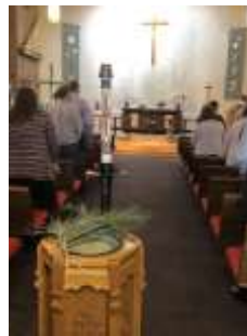
Palm Sunday April 2