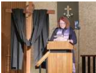
Good Friday April 7